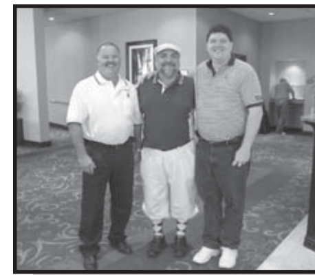
(Above) Can you spot the National Commander? Hint: He's the fashion conscious golf lover.

The Child Welfare Committee has reluctantly agreed that, WHEN we hit